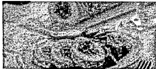
Cranberry and Sage Carver 031484