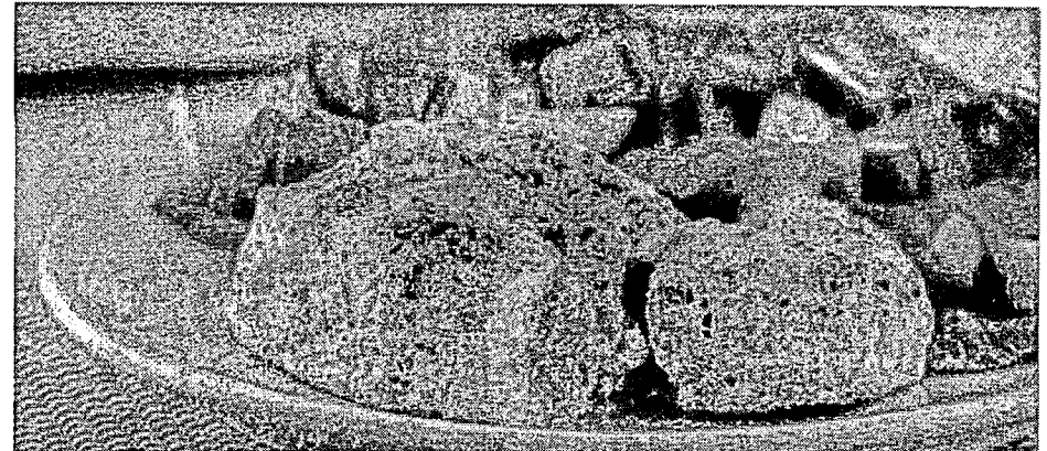
Signature Supreme ™ Premium Stuffed Chicken, Seasoned Broccoli & Cheese 046553