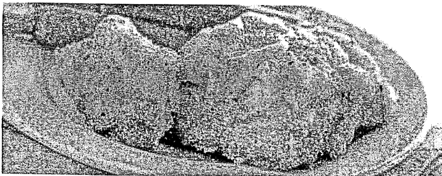
Signature Supreme™ Premium Stuffed Dark Meat Chicken, Broccoli & Cheese 045453