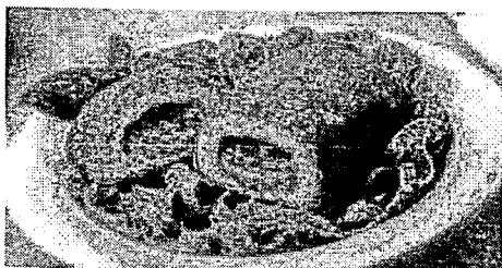
Homestyle Stuffed Chicken Kiev 020507

Coupon must be postmarked no later than 30 days following the offer validation date indicated. Please allow at least 6 weeks for return payment by check, made payable only to enduser. No consolidated payments to distributor allowed. Offer valid to individual foodservice establishments, one request per location only. Invoices submitted with this rebate not valid with any other offer. Offer does not apply to bid, military or contract accounts. For additional information, please call 1.888.723.8237.